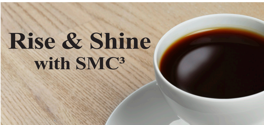
Rise & Shine with SMC 3

This 90-minute grand tour of Atlanta's historic Fox Theater will explore the Middle Eastern and Egyptian architectural influences that create the dreamlike grandeur of one of the best preserved 1920s movie palaces in existence. Directly across the street is the equally historic Georgian Terrace Hotel, which was added to the National Register of Historic Places in 1986. Here our guests will enjoy a delicious luncheon in the beautiful Mitchell Room followed by a guided tour of this iconic Atlanta landmark.