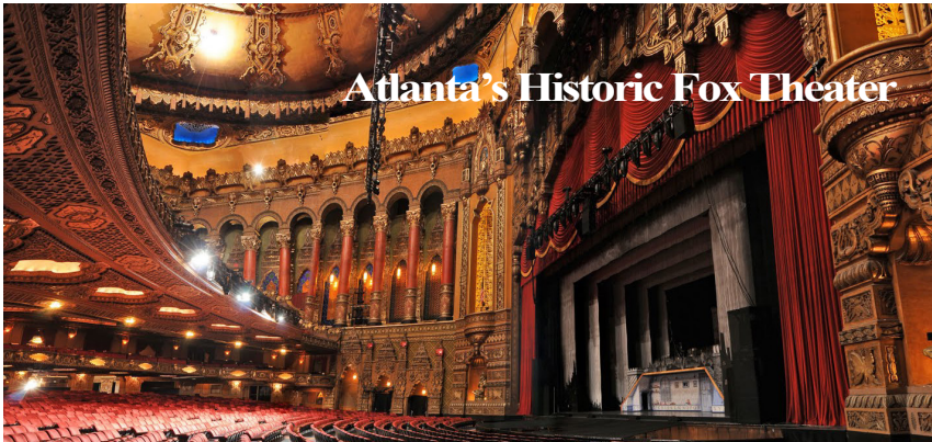
Atlanta's Historic Fox Theater

The Jump Start 2013 guest program allows you to share the conference's special events with a friend or family member. Guest registrations include admittance to all conference meals, evening entertainment, the keynote presentation, receptions and the following activities available only to paid guest participants: